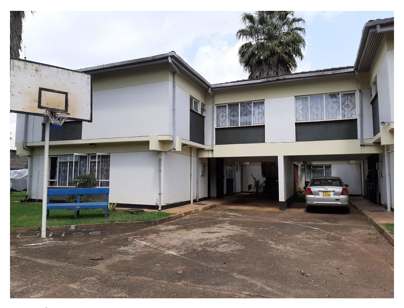
Houses 3 & 4

Short-term housing is available in houses 1-4. Inside each of these houses are four rooms: one master bedroom with an ensuite bathroom and three rooms with a shared bathroom. Master bedrooms are not available to trainees. The number of beds in the three rooms varies from 1-4. Servants Quarters (SQs) are rooms with outdoor entrances and a separate, shared bathroom are also available.