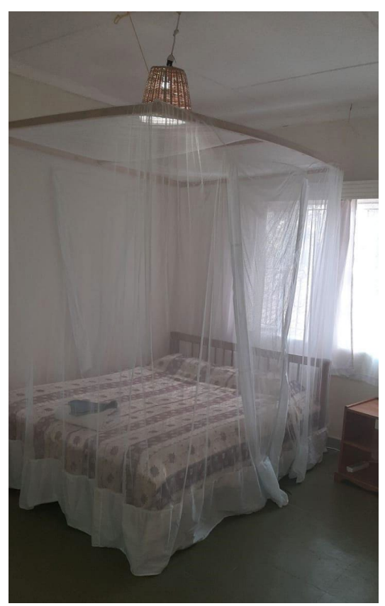
Room with one double bed (Houses 1-4)