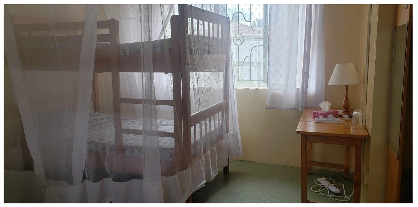
Room with one bunk bed (Houses 1-4)