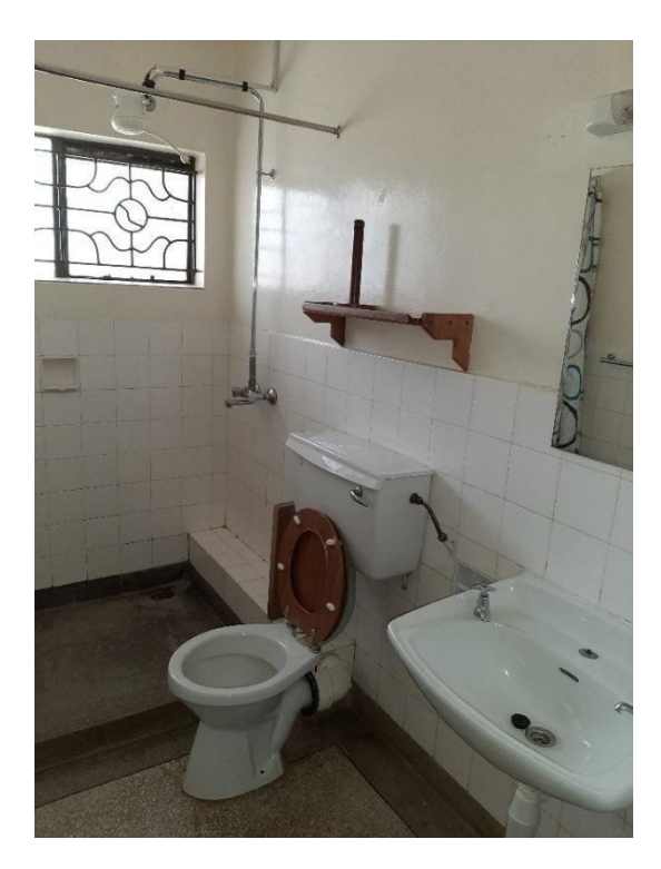
Shared bathrooms, with and without a tub (Houses 1-4)