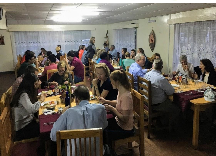
Dining Room at IU House