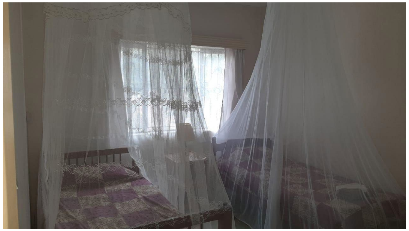
Room with two twin beds (Houses 1-4)