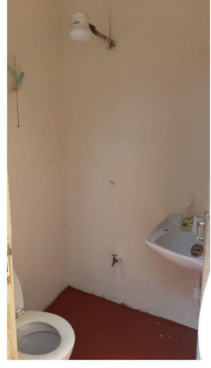
SQ bathroom: Shower and toilet area are in one combined room. No bathtub.