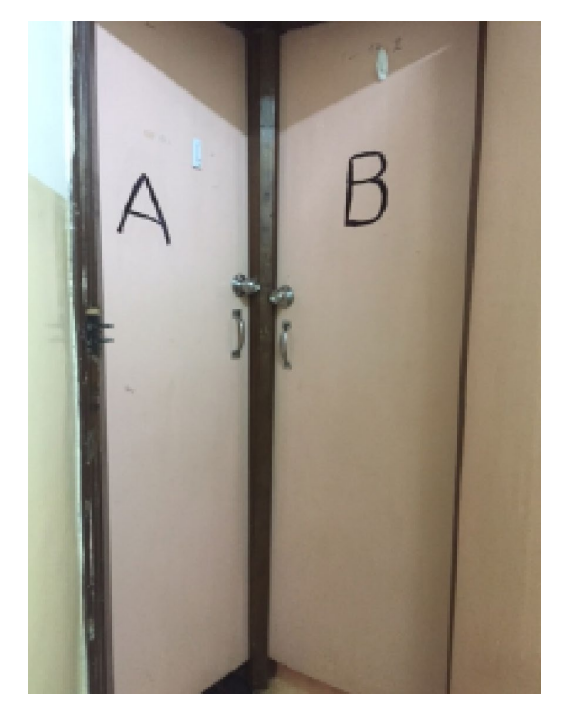
Entry to hostel rooms