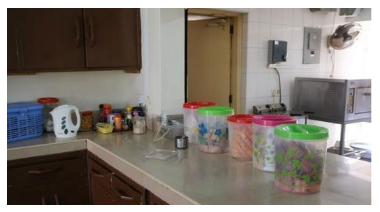
Breakfast at IU House is continental style.