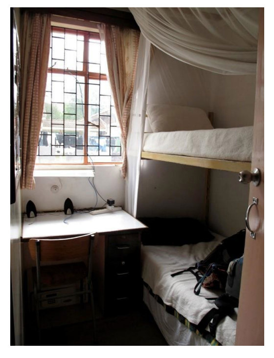
Aerial view of bunk and floor space