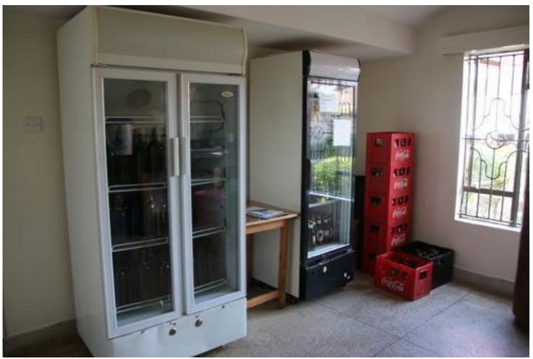
Clean water refrigerator (included and always available) and refrigerator for soft drinks and beer (available for purchase) at IU House