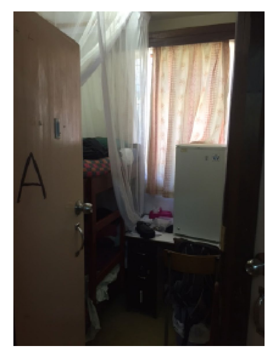
Room A (with fridge)