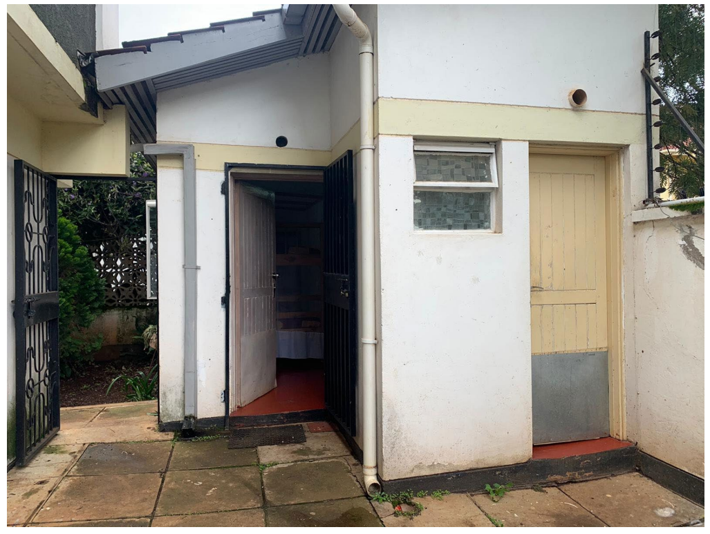
SQ room exterior & bathroom exterior