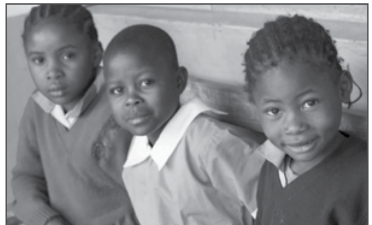
Nearly a third of the 53 million children orphaned in sub-Saharan Africa is due to AIDS.