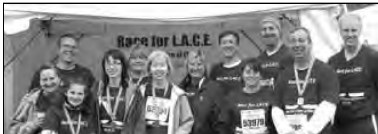
Indiana lawyers and friends raised funds in a "Race for LACE" during the 500 Festival Mini-Marathon